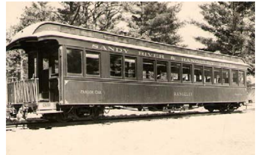
Sandy River & Rangeley Lakes parlor Car No. 9 Rangeley is the crown jewel of the MNG's "core collection" that will be relocated to Alna.