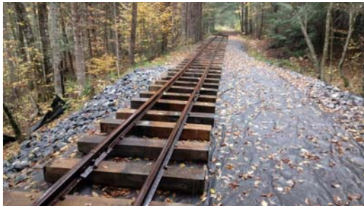
The end of the WW&F's newly laid track, looking north toward the Trout Brook bridge. (Mike Fox)

The Maine Narrow Gauge Railroad will continue to operate its vintage 2-foot gauge trains along the Portland waterfront, with a track lease that has been extended to 2039.