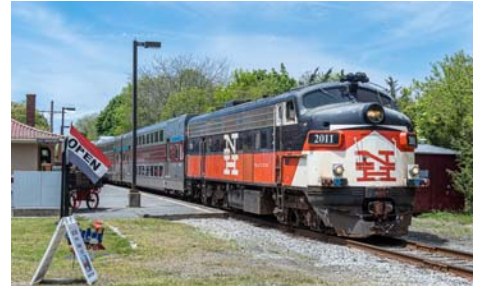
Cape Cod Central's FL9 2011 leads two former Long Island Railroad C1 bilevel coaches.

Boston-area passengers may make a guaranteed connection to our excursion train at Middleboro using MBTA train 1001 from Boston's South Station, Braintree and other stops along the Middleboro line. We'll return to Middleboro in time for connecting passengers to catch MBTA train 1014 back to Boston at 7:04 PM.